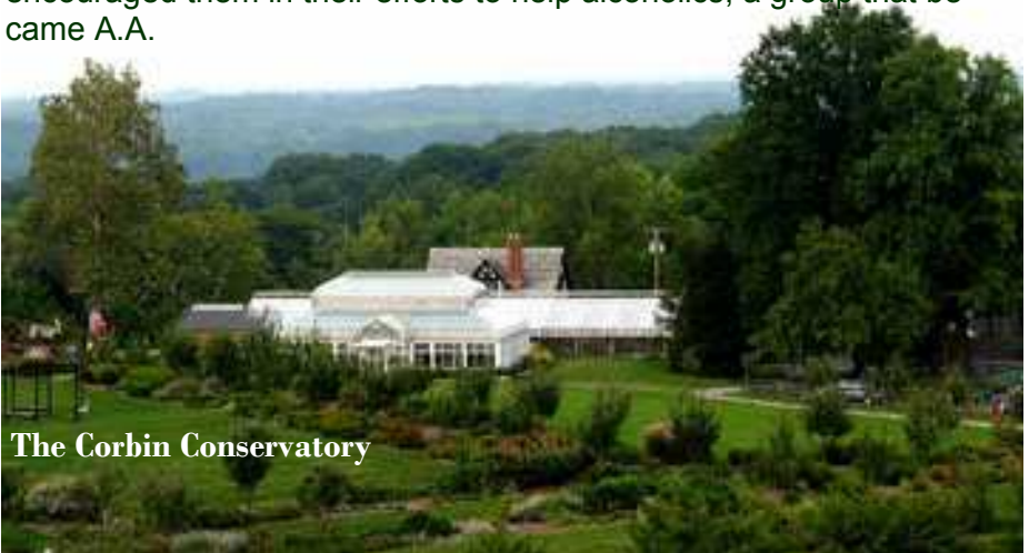
The Corbin Conservatory