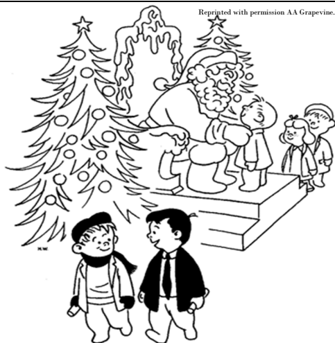
"I detected a new note of sincerity in his Ho! Ho! Ho! Ho! I think he's off the sauce."